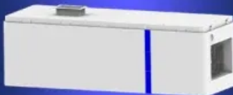
AI-W5.1-Base (Battery Base)